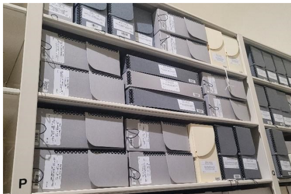
HSJ preserves some of our Branch's scrapbooks, meeting minutes, member directories and other historical documents.