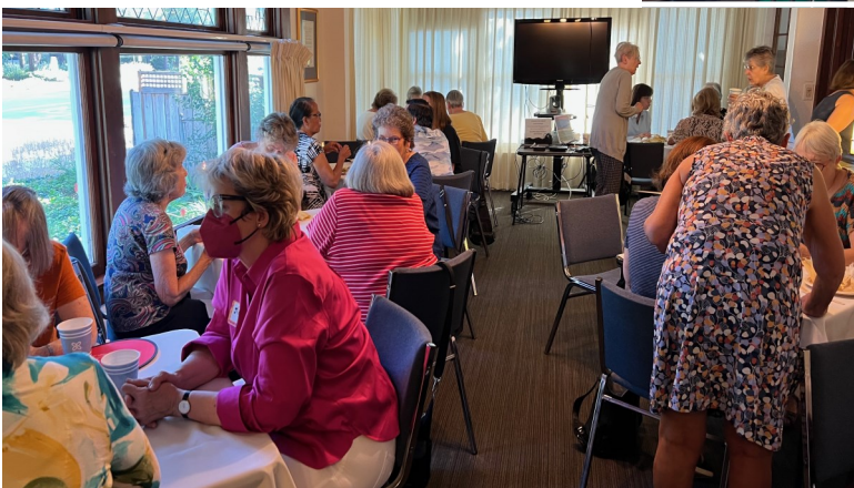
AAUW San Jose Branch Renewal Party

Refreshments will be served on the patio outside and the main event will be in the church hall.