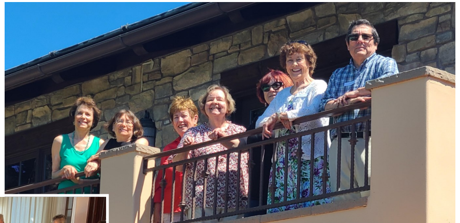
Some of the 2024-25 AAUW San Jose Branch Board Members