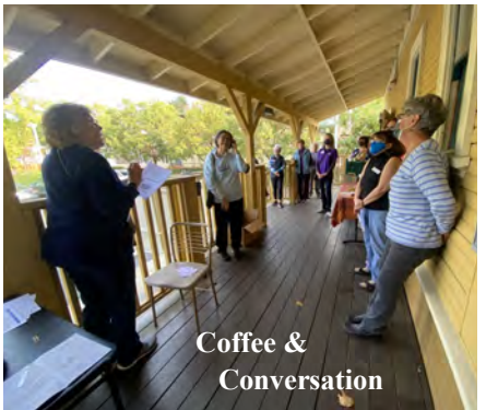
Coffee & Conversation