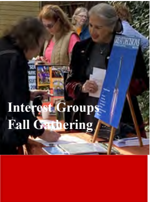
Interest Groups Fall Gathering