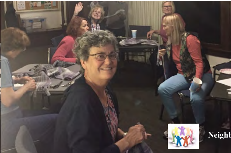
Neighbors Helping Neighbors