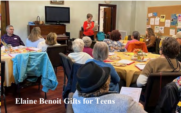
Elaine Benoit Gifts for Teens