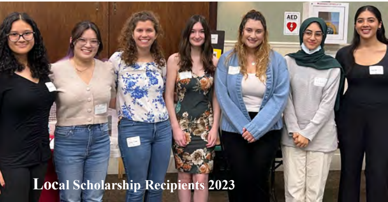
Local Scholarship Recipients 2023