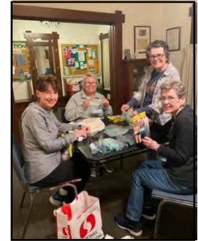
NHN members assemble kits for Front Door Communities

This December, NHN has budgeted funds to buy holiday gift cards for the clients of Next Door Solutions to Domestic Violence, Sacred Heart Community Service and Santa Maria Urban Ministries. These cards are requested and gratefully accepted by these agencies for distribution.