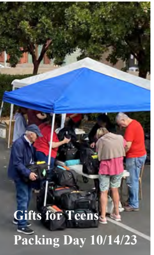
Gifts for Teens Packing Day 10/14/23