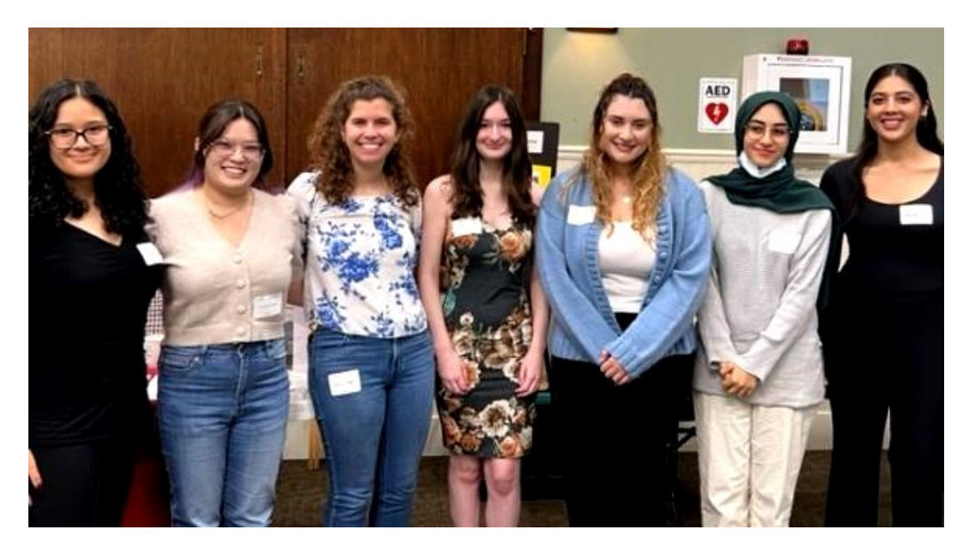
Congratulations to our 2023 Local Scholarship Recipients. These young women attended the Fall Gathering.

Today, women make up only 34% of the STEM workforce. Only 16% of engineers are women. We would like to close the gender STEM gap by providing programs like Tech Trek to give girls the confidence, skills and inspiration to pursue careers in STEM.