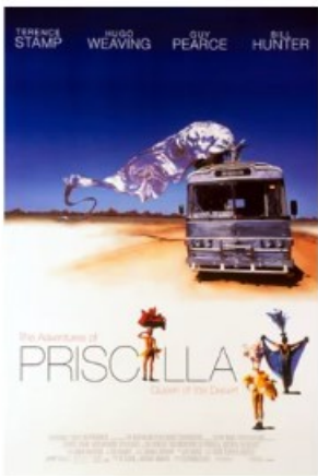
October 7, 2022

Covid considerations: For those looking for Covid-conscious entertainment, please note that they have blocked off every other row of the auditorium and the box office system will automatically force two seats on either side of your order to go offline after you make your reservation so you have distance between yourself and the next party.