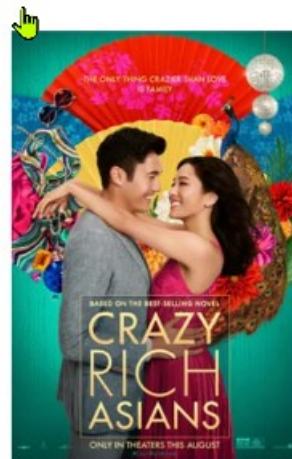
October 11, 2022