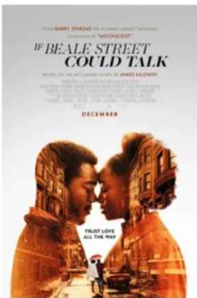
October 12, 2022