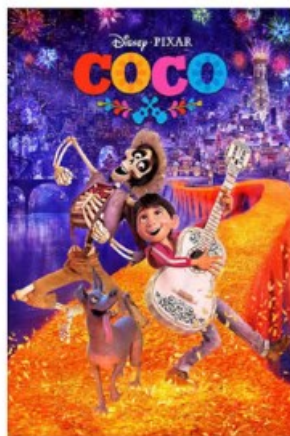
October 29 & 30, 2022