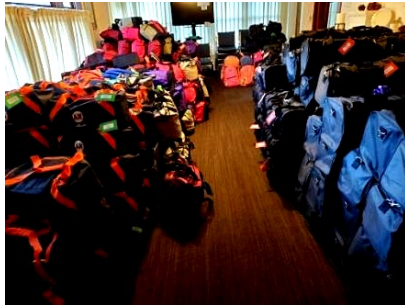
Male Duffel Bags and Girl's Totes packed and ready for pickup.