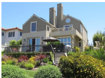
Santa Cruz Harbor Home