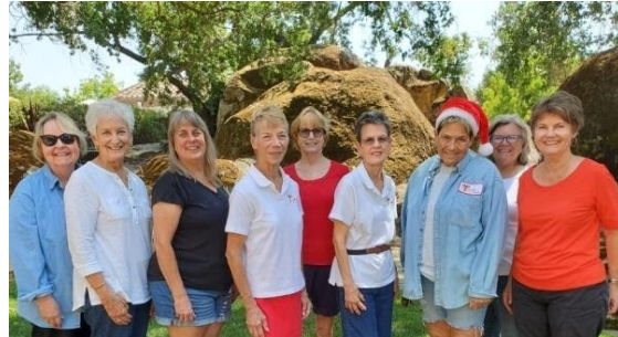
Gifts for Teens Committee

This year's Gifts for Teens bags and totes were among the nicest and fullest ever in our history.