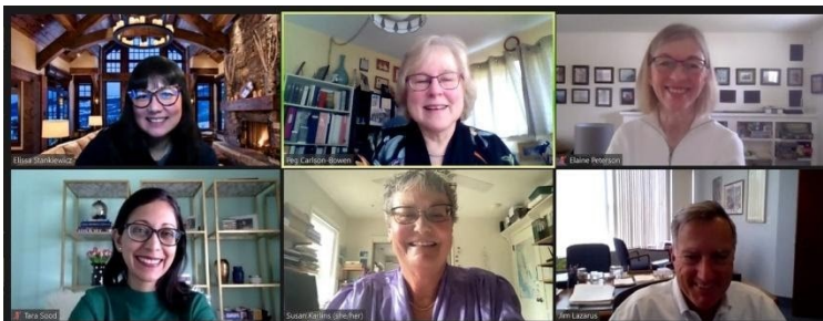
Zoom meeting with the State Director for Dianne Feinstein

The Public Policy Committee has been supporting 11 AAUW CA supported bills and 5 AAUW National bills through Zoom legislative visits, calls and letters to legislators. We are preparing a mailing to area Title IX coordinators at schools and colleges, and we're planning for a 50th Anniversary of Title IX outreach event next spring with area AAUW branches.