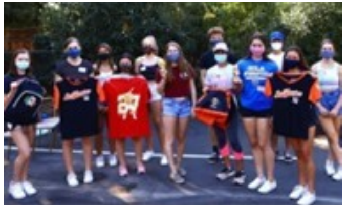
Pioneer GFT Club teens displaying SF Giants donations

It is exciting to see compassionate and aware teens reaching out to help teens in need that they have never met! These young people are making a positive impact in San Jose.