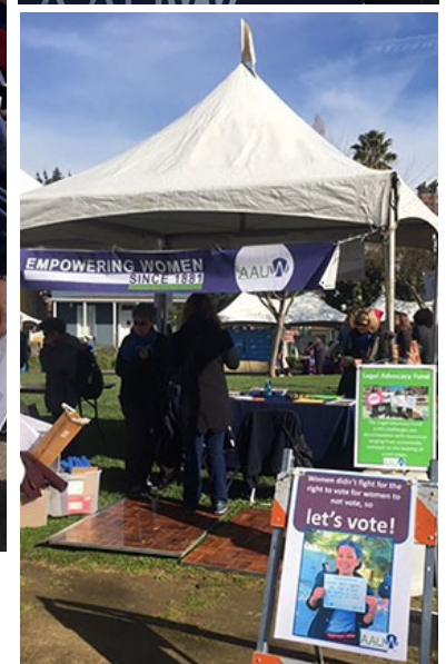
Womxn's March San Jose January 18, 2020