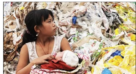
From the film "Plastic China"