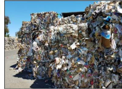
Plastic sorting facility in San Jose

USElessPLASTIC: Rethinking Recycling Wednesday September 18 - 7 pm 5 pm - pre-program showing of the 2016 documentary "Plastic China"