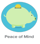
Peace of Mind