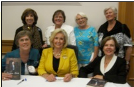
Lilly Ledbetter surrounded by AAUW San Jose Branch members.