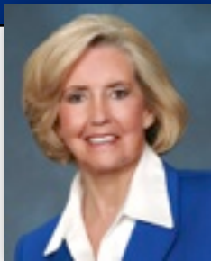
Lilly Ledbetter Keynote Speaker at SJSU South Bay Women's Conference March 8, 1-3PM

The sole purpose of this publication is to convey the association's business to its membership. Only articles and announcements related to Branch business will be considered for inclusion.