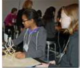
Building an earthquake-proof structure.

During a field trip to the Tech Museum, the girls participated in a workshop on earthquakes. After learning about the science of designing for earthquake-safe buildings, the girls made their own building from popsicle sticks and glue that they hoped would stand up to an earthquake. When the buildings were put to the test, many were surprised and pleased that their building met earthquake standards and did not collapse or fall down. This activity was greatly enjoyed by these budding earthquake scientists.